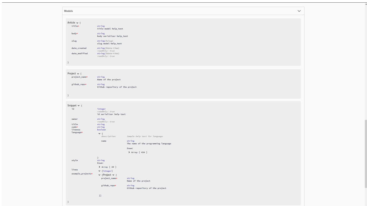
Fig. 3: Real Model definitions.